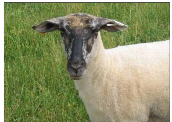
This lamb is the F1 generation from Gulf Coast and Suffolk parents.

Still, it is useful to know which breeds have shown parasite resistance. Incorporating one of those breeds may have almost immediate impact on internal parasite problems and will have long-term benefits. Again, the farm goals and production traits of importance must be kept in mind. Also, when using a resistant breed for crossbreeding, there will be a lot of variability in the F1 and F2 generation. (Crossing two breeds results in the F1 generation; crossing the F1 ewes with F1