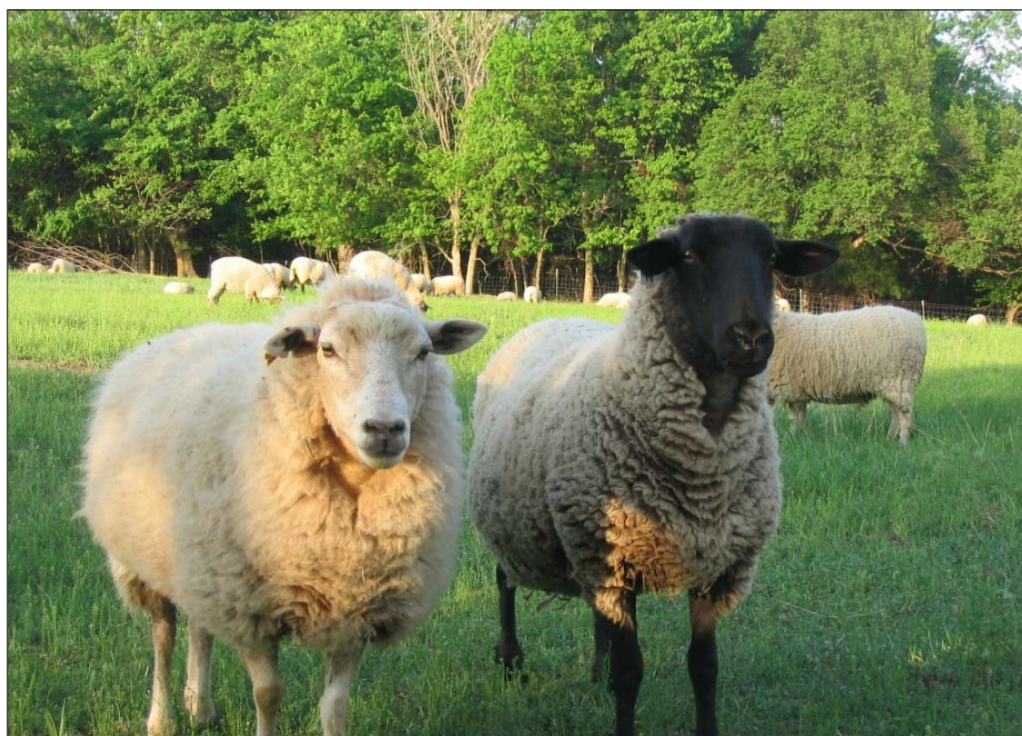
Animals can be selected for their resistance to parasites, resulting in a stronger flock.

For long-term animal health, improving sheep and goat resistance or resilience to internal parasites is a very important strategy. Animal breeding can build a stronger, more resistant herd or flock if producers will identify and select the best animals for long-term health. This publication discusses methods and rationale for selecting sheep and goats with improved resistance or resilience to internal parasites. It also briefly describes other management tools helpful to producers and to the small ruminants raised in humid areas.