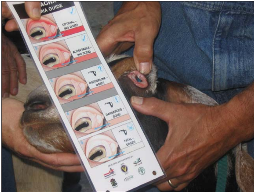
The FAMACHA® system can help identify resistant or resilient animals.