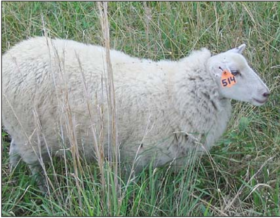
Gulf Coast Native sheep are resistant to internal parasites.

rams yields the F2 generation.) See, for example, the work of J. E. Miller, who experimented with Suffolk (susceptible) and Gulf Coast Native (resistant) sheep (Miller et al., 2006). During that experiment, he found in one infection period FEC in the F2 sheep ranging from 167-149,933 eggs per gram. An article that includes a table listing resistant breeds of sheep is available at www.aces.edu/pubs/docs/U/UNP-0006 .