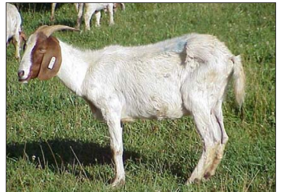
This goat is suffering from internal parasites. Note the posture, extreme thinness, poor hair coat and lack of vigor.