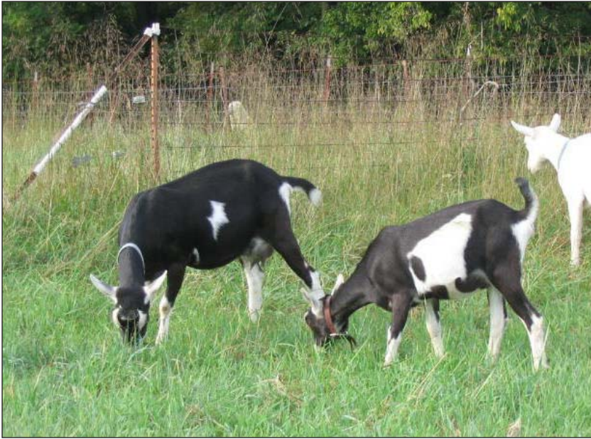
Just as coat color is heritable, so is resistance to internal parasite infection.

Resistance is measured by taking fecal samples and doing quantitative fecal egg counts on animals that have not been dewormed in at least six weeks (preferably all animals treated or untreated similarly). Animals shedding fewer eggs are then identified and retained for breeding, while animals shedding the most eggs would be identified and then culled. Rams and bucks provide half of the genetic material for the lamb and kid crop, so choosing a more resistant sire would have a large impact on the parasite resistance and contamination level on the farm in years to come.