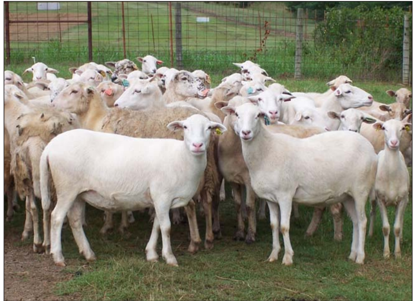
St. Croix and Katahdin sheep.

It can be difficult to see the difference between