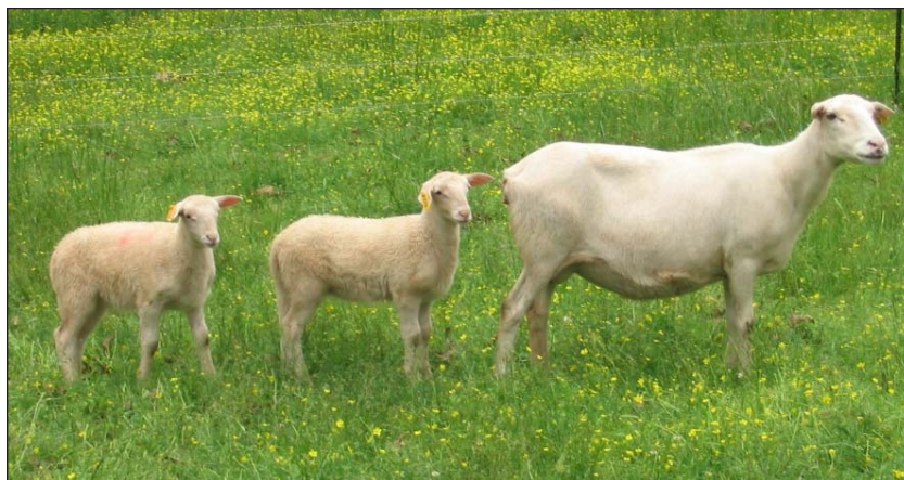
Katahdin ewe and lambs.

However, there are many factors that affect fecal egg counts besides the susceptibility of the animal. These include the level of exposure (challenge), stage of production of the animals (young or lactating animals may shed more eggs), and the type of forage being grazed (consuming high-tannin forage such as sericea lespedeza causes fecal egg counts to drop dramatically). Supplementation or otherwise providing better nutrition has been shown to lower FEC (Kahn et al., 2003; Eady et al., 2003) and reduce anemia (Burke et al., 2004). Also, the parasites themselves account for some variation. Some parasites (such as Haemonchus contortus ) are very prolific and will produce a lot of eggs. Other species may not; for those, a lower egg count may still mean a serious internal parasite infection. Also, internal parasites don't lay eggs continuously and so eggs are not evenly distributed in feces. If you sample an animal twice, you will find some variation in fecal egg count even on the same day. And the number of adult worms inside the animal may not be well correlated with the fecal egg count (Saddiqi et al., 2010); immature adults and older worms produce less and males produce none.