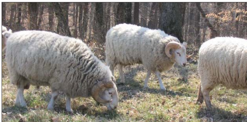
Rams and bucks have a large impact on the parasite status of the farm. These Gulf Coast rams have never needed deworming.

R esearch has shown that internal parasites are not evenly distributed in a herd or flock.