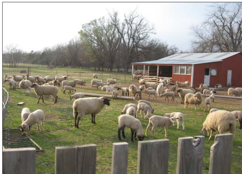
Keeping records and selecting animals with the ability to fight off parasites is the best long-term strategy for managing internal parasites.

It may seem that selecting for resistance to internal parasites involves a lot of extra work. Researchers admit that it will take a lot of time to make significant progress so that a flock will be relatively free of clinical disease even under challenge. Internal parasites have many advantages in this game, including the ability to wait for the right time to become active again and infect animals or to actively breed and lay eggs so that eggs will be deposited during a favorable time of the year. Parasites are prolific and can cause enormous problems to the host in a relatively short period of time.