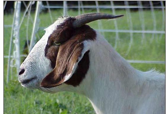
Bottle jaw.

When adult parasite numbers inside the host animal reach a level that causes obvious illness, producers have historically relied on anthelmintics (dewormers) to kill the parasites and allow the animal to heal and recover. However, as the animal grazes, it may be continually ingesting more parasite larvae, giving a new "crop" of parasites a home inside the animal. The presence of parasite larvae in the environment is often referred to as a "challenge," and animals that can perform well in spite of the challenge are either resilient (tolerant) or resistant to internal parasites. Selecting animals that are resistant will lower the challenge on the