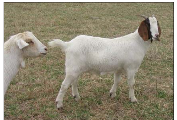
This goat appears healthy and in good condition.

(warm, wet). The larvae mature inside the host, and the cycle continues.