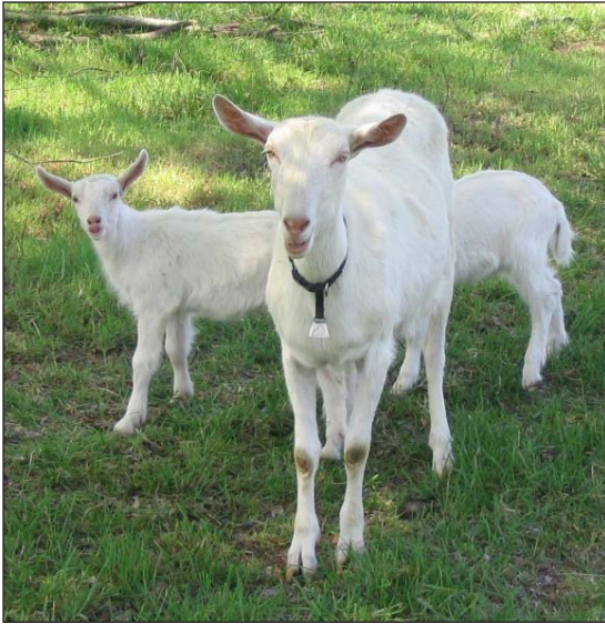
This yearling dairy doe is nursing twins and may have a higher fecal egg count than an older or dry doe.