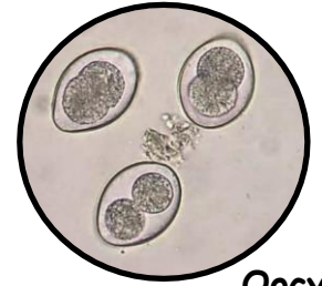
Oocysts in feces

Coccidiosis is one of the most economically important diseases of small ruminants. It is caused by microscopic, single cell protozoan parasites of the genus Eimeria . Coccidiosis should be suspected any time there are digestive problems in young animals that are being raised under intensive conditions (inside or outside).