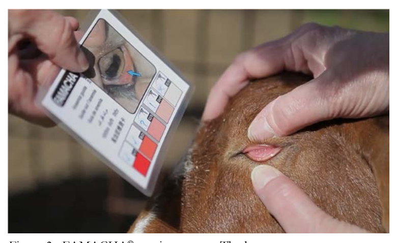
Figure 3. FAMACHA® scoring a goat. The lower eye mucous membranes are exposed and compared to the colors on the FAMACHA® card to estimate the level of anemia. Use the COVER, PUSH, PULL, POP! method described above.

• Proper FAMACHA<sup>©</sup> scoring technique includes exposing the lower eye mucous membranes and matching them to the equivalent color on the FAMACHA<sup>©</sup> card (Figure 3). COVER , PUSH , PULL , POP is a 4-step process describing the proper technique.