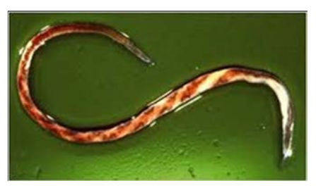
Figure 1. Barber pole worm (Haemonchus contortus)

The FAMACHA<sup>©</sup> system was developed in South Africa to estimate the level of anemia in sheep and goats associated with barber pole worm ( Haemonchus contortus ) infection and use that information to make deworming decisions.