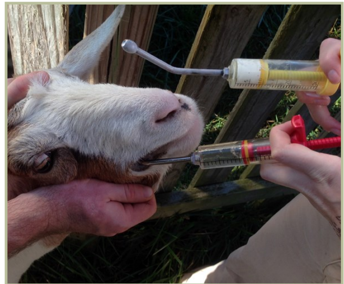
Do not mix dewormers.

underdosing is avoided. A pet digital scale for large dogs works well to weigh most goats and sheep. These large dog scales are affordable and portable. Weigh tapes may be accurate for goats. If working with a large herd or flock, invest in an alleyway and a weigh scale that rests in a chute system. This investment saves time and labor.