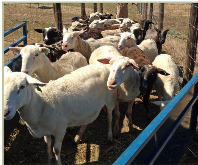
Invest in a handling system.

The benzimidazoles are called the “white dewormers” based on their appearance. This class of dewormers generally has a wide margin of safety. The two benzimidazoles most commonly used in small ruminants and camelids are (1) fenbendazole (Panacur®, Safe-Guard®), and (2) albendazole (Valbazen®). Albendazole is the most potent member of the benzimidazole class. It should not be used in the first 30 days of pregnancy because it can damage the fetus(es). Multiple-day dosing of the white dewormers can improve efficacy, if the worms have only low level resistance. However, the resistance level to the benzimidazoles is so high in barber pole and black scour worms in the southeastern United States (and other areas), that multiple-day dosing is now of limited benefit.